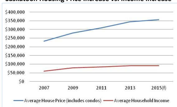
Saskatoon Housing Price Increase vs. Income Increase

The Saskatoon housing market has experienced rapid price increases since 2006. For example, in 2016, the average MLS resale price of a home increased to $356,462 in Saskatoon, a nearly 300% increase compared to a decade earlier. Rental prices also experienced a significant increase.