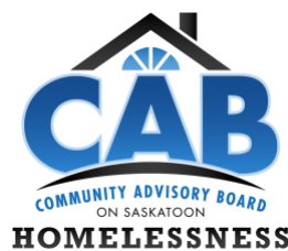
Source: 2015 SaskatoonPoint in Time Count

47% EPISODICALLY HOMELESS 47% CHRONICALLY HOMELESS